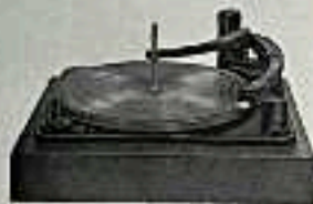
The Constellation, Model TC 88—$29.98

our British cousins at Collaro stress meticulous care and precision engineering in every Collaro stereo record player!