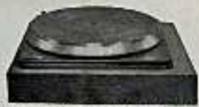
The Constellation Turbocoll, Model TC 208—$49.98