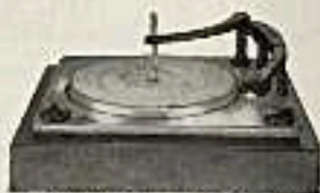
The Constellation II, Model TC 746—$42.50 *The Constellation II, Model TC 640—$38.98