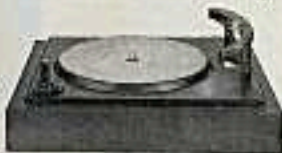
The Model Player, Model TP 28—$28.95